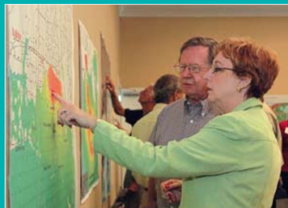
Maps can help people better understand a community's vulnerability to hazards.

One of smart growth's signature characteristics is a meaningful public involvement process that ensures that the needs and concerns of all affected stakeholders are identified and addressed. Successful development requires inclusive planning processes that give community members and other stakeholders a clear voice in the development process. Growth can create great places to live, work, and play—if it responds to the community's vision of how and where it wants to grow.