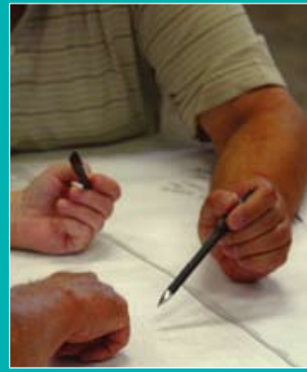
The Marquette Plan provides a regional vision for 45 miles of shoreline along Lake Michigan in Northwest Indiana.