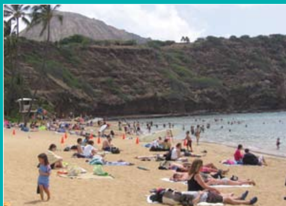
Public access to the water is critical to coastal and waterfront communities.